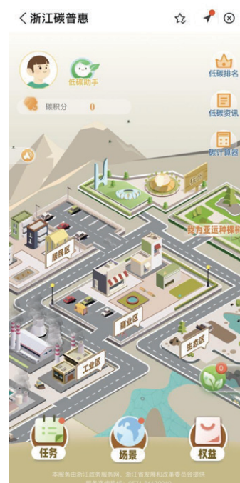
Figure: Interface of “Zhejiang Carbon Accounting” App

In March 2022, “ Zhejiang Carbon Accounting ” App, developed under the initiation of the Zhejiang Provincial Development and Reform Commission, was officially released on Zhejiang QR Code App. As the first provincial carbon inclusion App in China, “Zhejiang Carbon Accounting” App will record the low carbon behaviors of residents in their daily life—such as green travel and online transaction—after green and low carbon scenario is opened, and accumulate the low carbon behaviors to carbon credits. The App has achieved data connection with Alipay Ant Forest, Huge Recycle and other platforms.