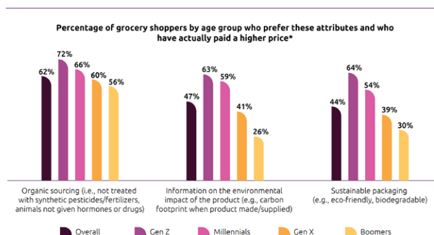
Figure: The younger generations are most conscious of sustainability