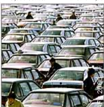
To bolster its application to host the 2008 Summer Olympic Games, Beijing intends to improve the image of its taxis by imposing new standards on taxis.

The Beijing Bus General Factory plans to produce 1,000 natural gas buses for the capital's public transportation system by the end of this year. By then Beijing will become world's leading city in the total number of CNG buses. The company last year made 300 such buses powered by Cummins CNG engines.